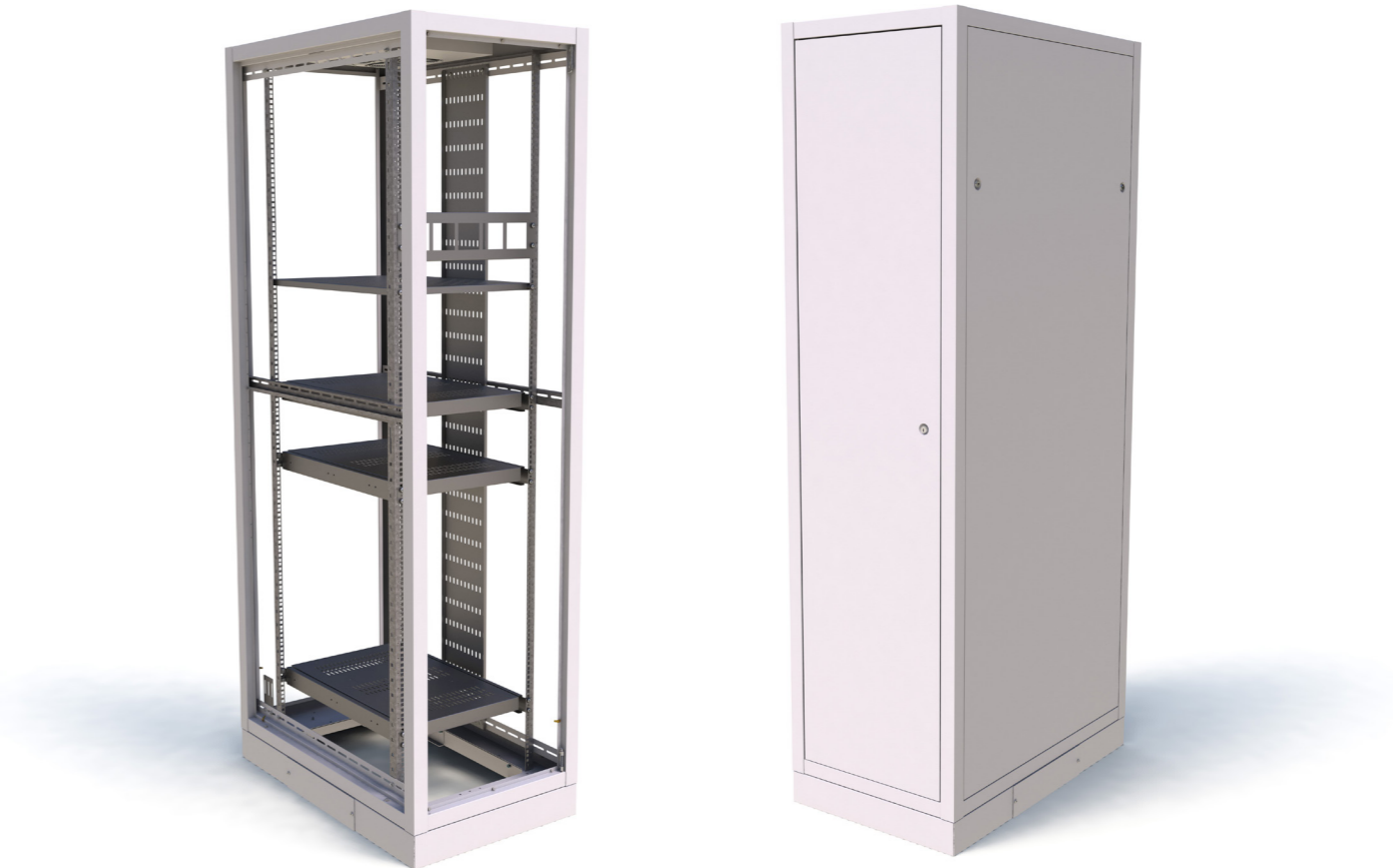
Server Cabinet 4760100 - Light Grey